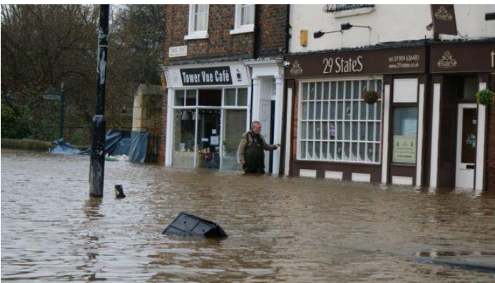
Flooding across the UK