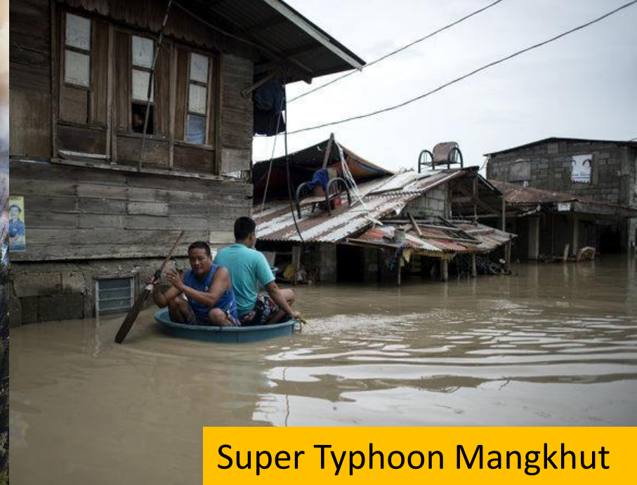
Super Typhoon Mangkhut