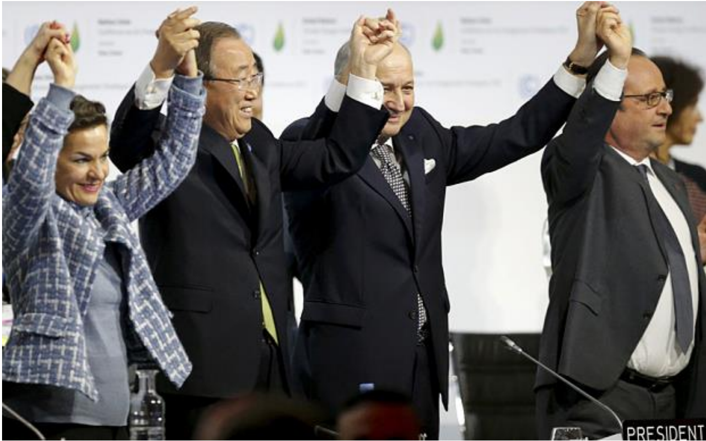
Claire Perry UK COP 26 President